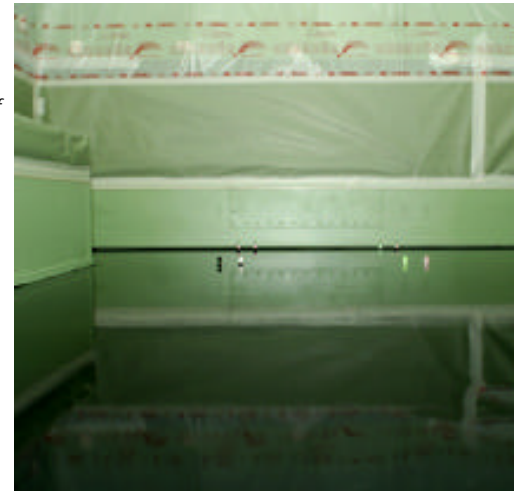
Military Shelter with LINE-X CU-400 self leveling material