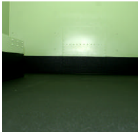
Completed Military Shelter with non-slip LINE-X XS-100 Coating