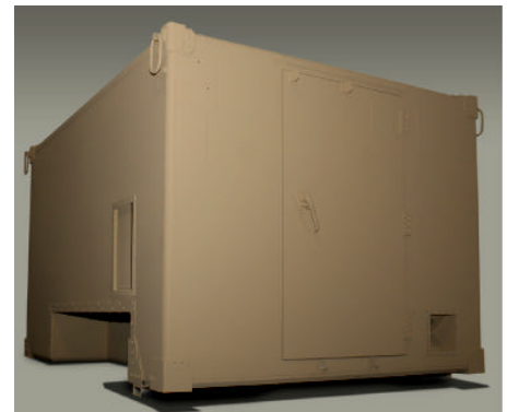
Exterior view of a typical Military Shelter

Advanced Protective Coatings Contact: Paul De Smet